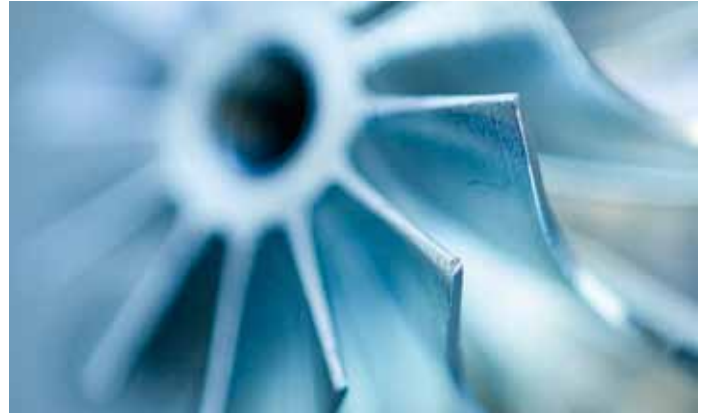
Reliable turbine technology – excellent efficiency.