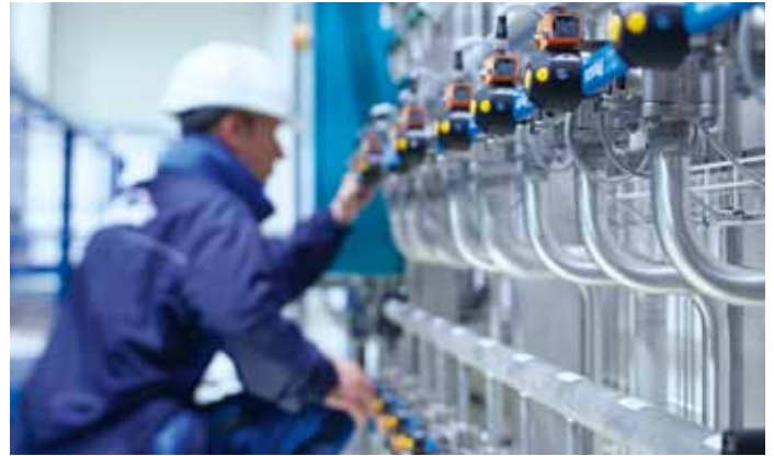
Low maintenance costs – optimal protection for your investment.

A further plus for the efficient L-Series is the extremely short cooling time before the system is ready for production. This quality is reflected in extremely low power and liquid nitrogen consumption levels. The compact, modular coldbox design with integrated freeze-out purifier (which reliably removes all impurities) helps control the cost of installation. The standalone peripherals of the control hardware allow flexible “plug & run” installation.