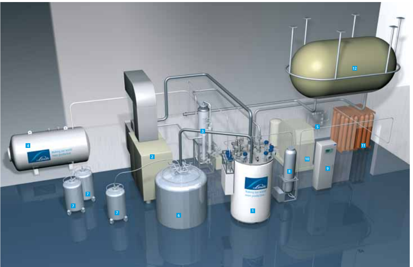
Helium liquefaction plant (side view)