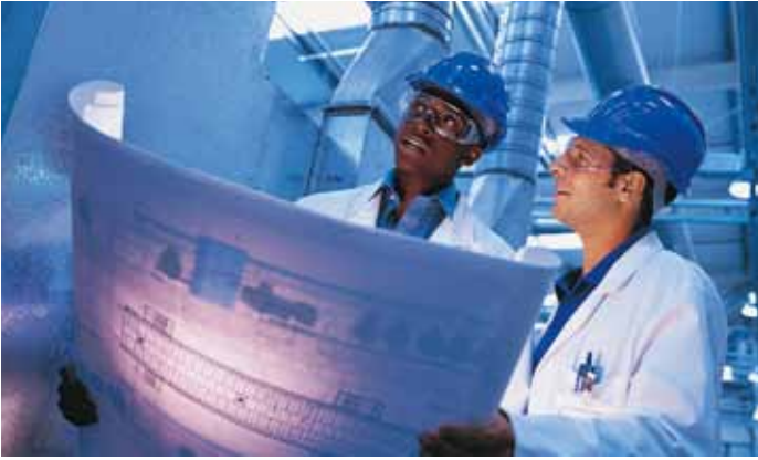
Sophisticated design – compact, flexible installation.