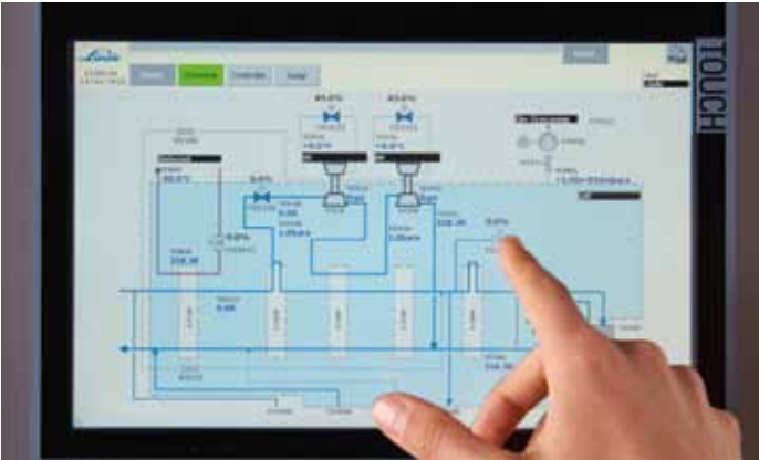
User-friendly – fully automated.