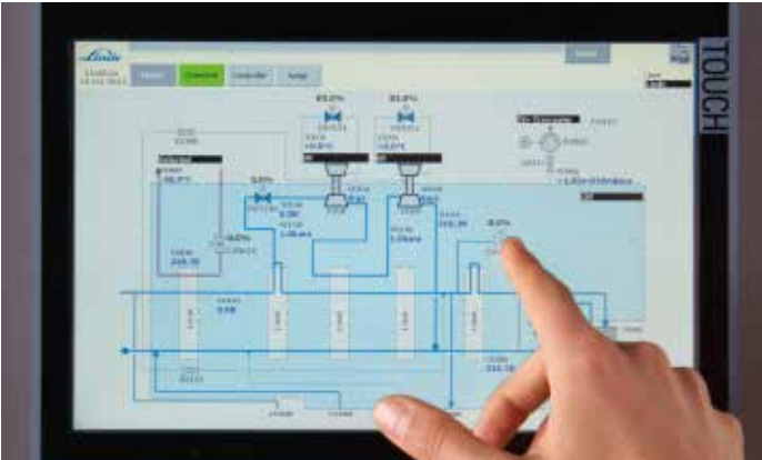
User-friendly – fully automated.