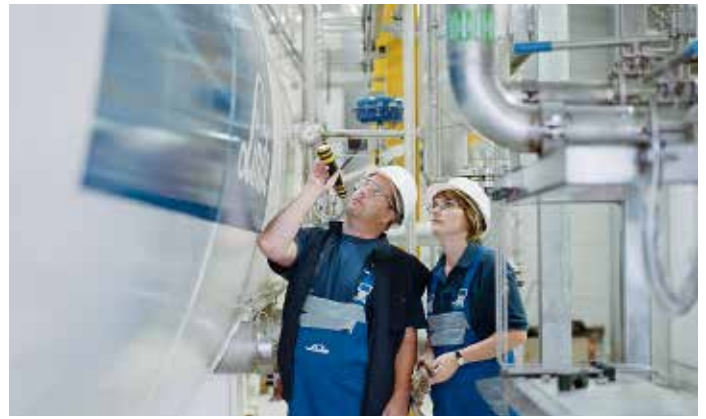
Hydrogen liquefaction plant in Leuna, Germany.