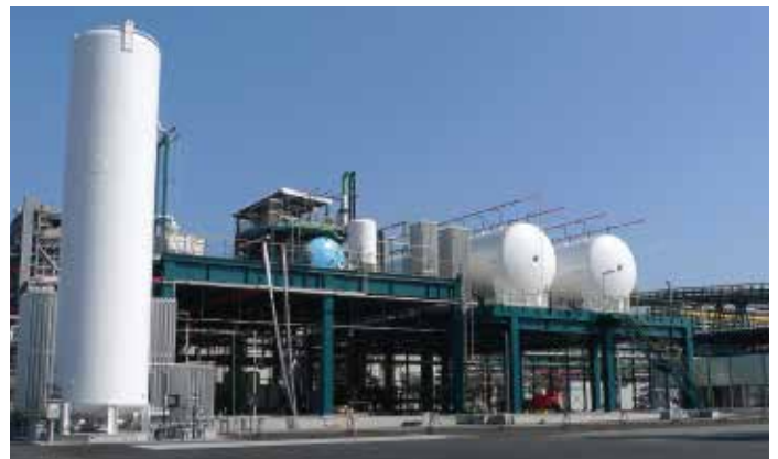
Purification and liquefaction of H 2 .