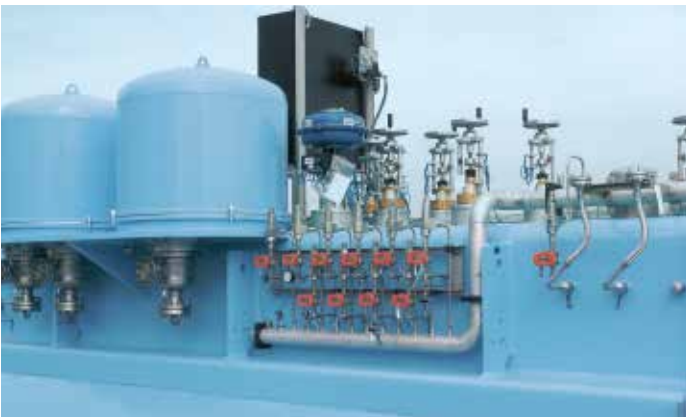
Coldbox and turbo expanders.