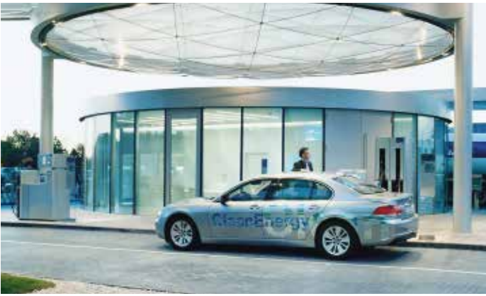
Linde hydrogen filling station in Unterschleissheim, Germany.