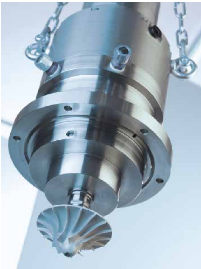
Drive cartridge with cold compressor rotor for 2K systems.