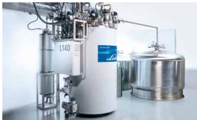
Standard L-Series helium liquefier with dryer and dewar.