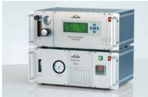
Multi Component Detector